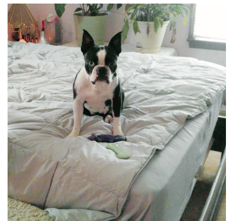
Now living life on the bed!

Thanks to Beth Winters for monitoring cameras and traps and allowing her driveway to be turned in to "trap central" and a huge shout out to Sam from PURE GOLD TRACKERS! 🐾